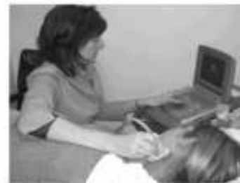
(Ultrasound imaging of the Carotid Arteries)

High Cholesterol, Kidney/Liver/Thyroid Disorders, Bone Loss, etc.?