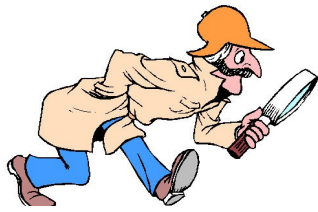
The Amazing Hunt