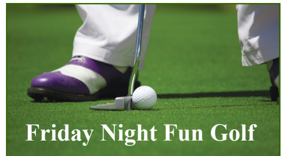
Friday Night Fun Golf